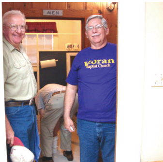
Koran Baptist men's mission group renovated the bathrooms.

So far I have had 110 seafarers from 13 ships in the center. The majority was from China, the Philippines, and India; the rest came from Eastern and Middle Europe, Ukraine, Russia, and Myanmar.