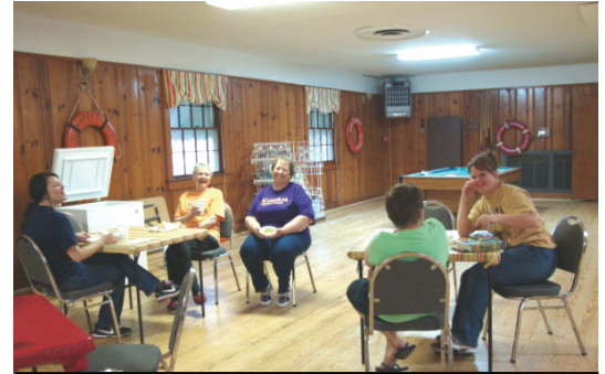
Koran Baptist Church mission group helped tremendously to get the center ready.

ministry at every terminal that I found but it seems the flyers do not make their way to the ships' crews. The most came or called because they knew the center was here.